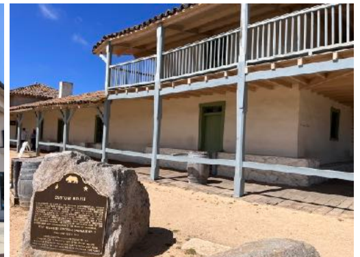
Stanton Center, left, and Custom House on Monterey's historic plaza